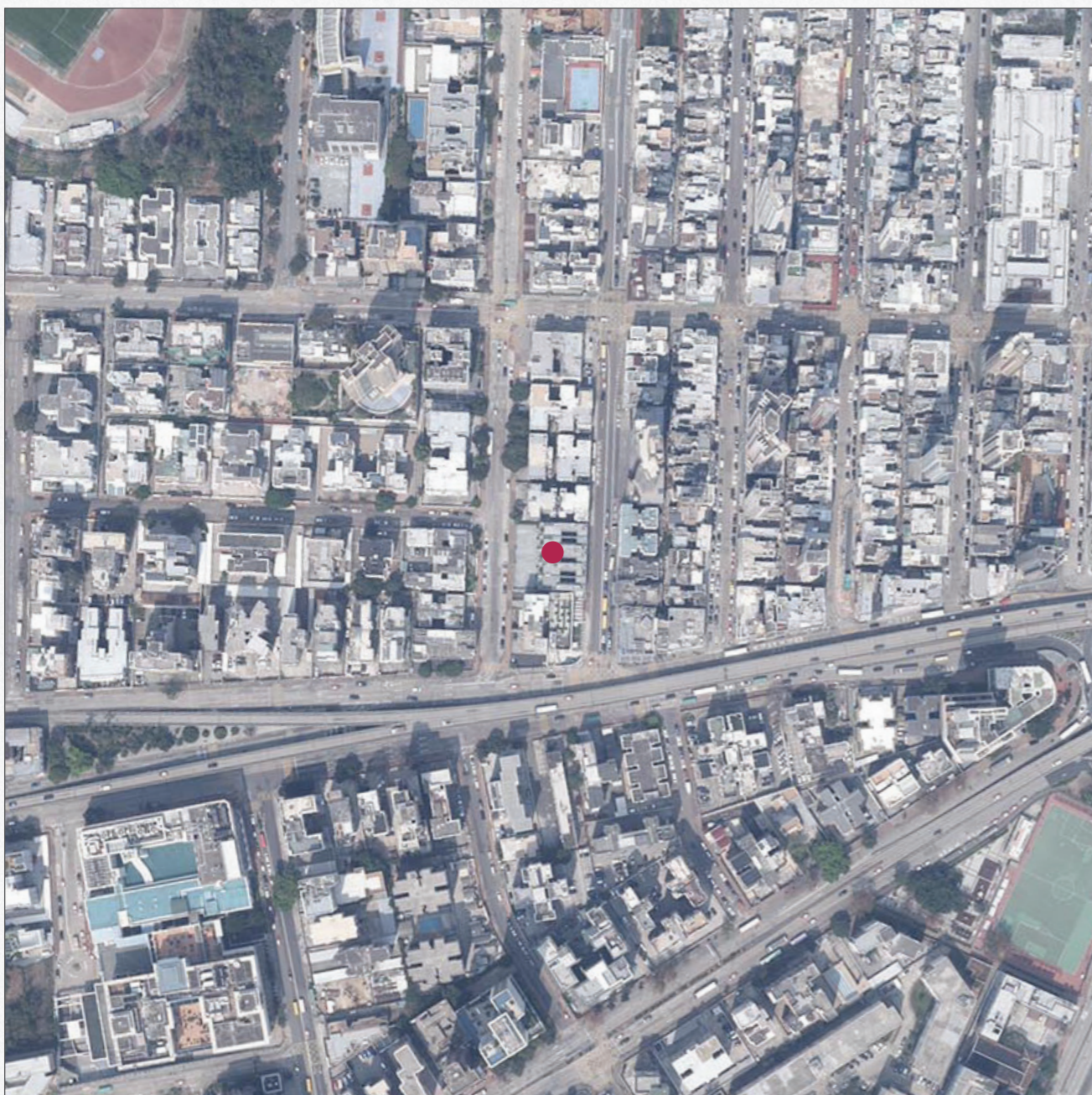
● Location of the Development 發展項目的位置

Adopted from part of the aerial photograph taken by the Survey and Mapping Office of Lands Department at a flying height of 6,000 feet, photo No. E218538C dated 8 March 2024.